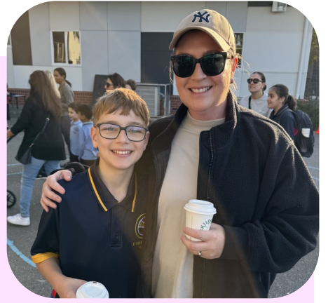
Mother's Day Breakfast